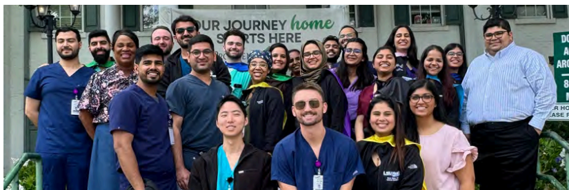
Internal Medicine Residents at LSU Health Shreveport recently toured to learn more about Providence House and its mission. At the core of every question was, "How can we better help?" Thank you for your commitment to our community!