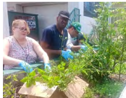
We are incredibly grateful for our new partnership with volunteers from The Arc Caddo-Bossier . This happy, hard-working group will be helping out weekly in the donation center and around the campus.