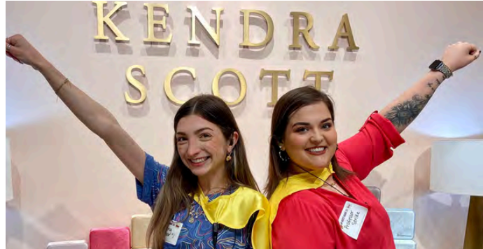
The staff at KENDRA SCOTT SHREVEPORT are long-time supporters. Providence House benefitted from Mothers Day shoppers at the Kendra Gives Back event on May 9th.