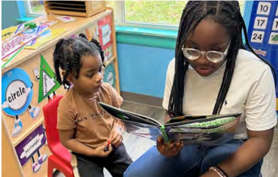
Did you know you can volunteer to read to our CDC students? It's true! Just 30 minutes of your time creates a huge impact for our little ones.

Providence House is the beneficiary of so much good. Below is a small sampling of how our community continually supports our families. We never tire of saying "thank you!"